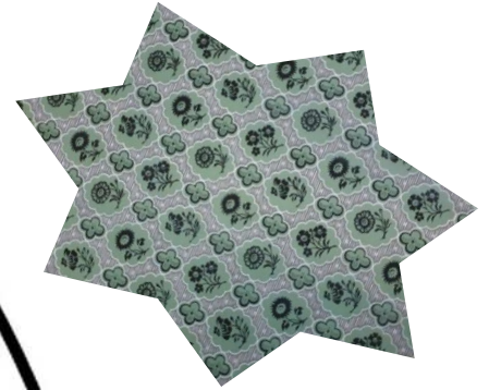
Wallpaper from John Wesley's House

One of her favourite things in John Wesley's House is the wallpaper. She likes the bright colours and patterns on it.